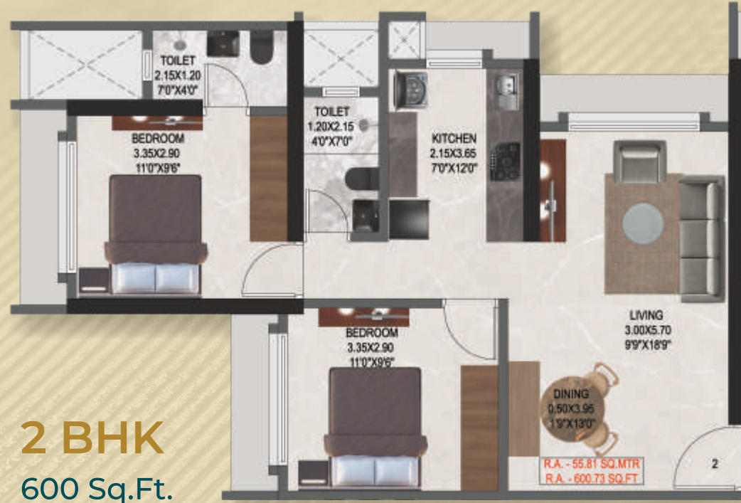
2 BHK 600 Sq.Ft.