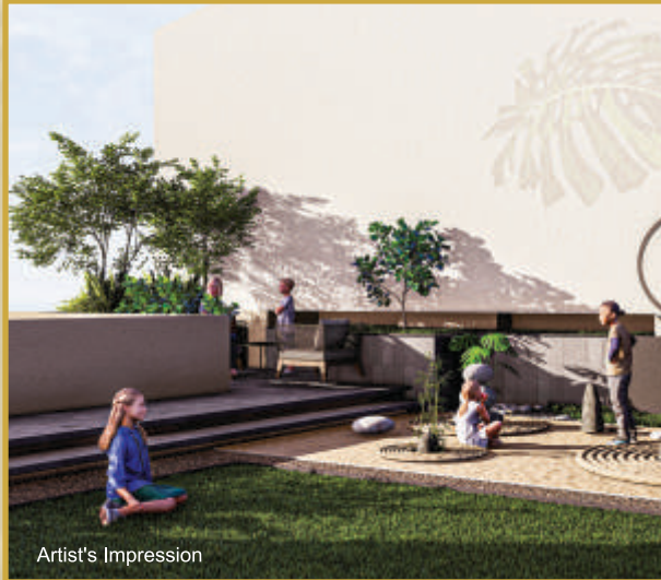
DELIGHTFUL LAWN AREA