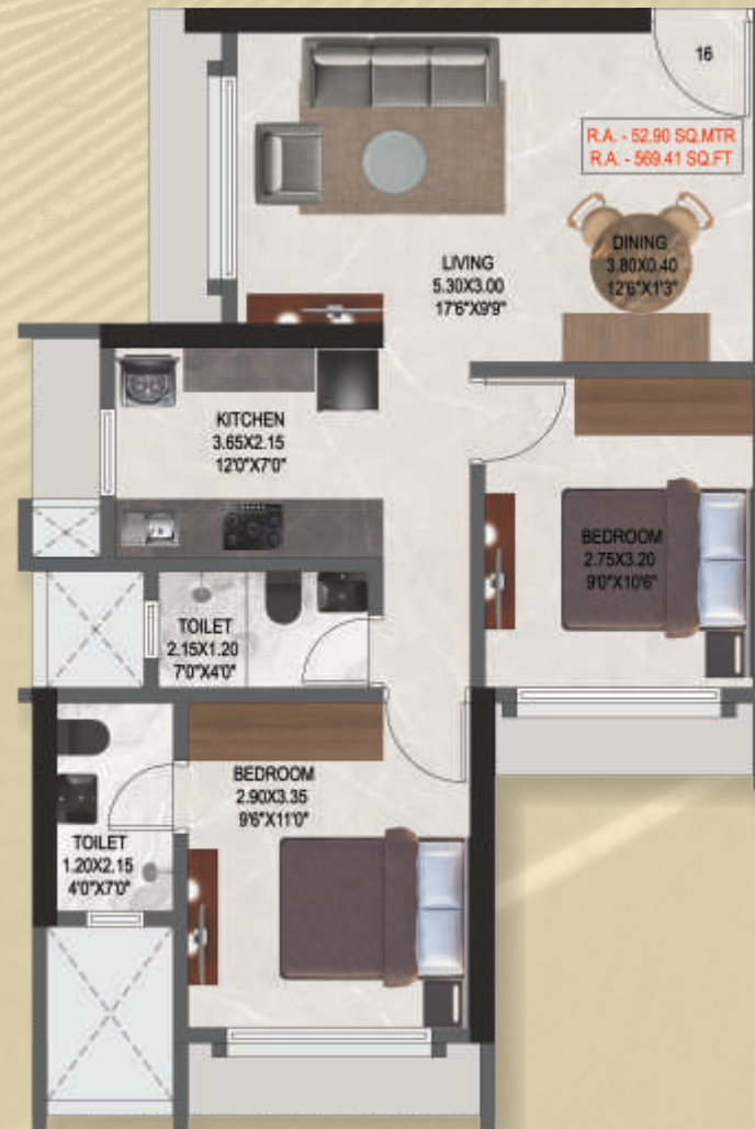
2 BHK 569 Sq.Ft.